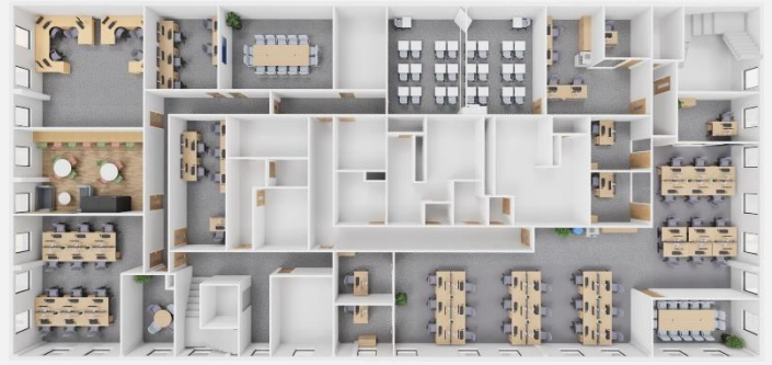
layout schemes & 3D renders

The new offices are finished throughout in a light and calm neutral colour scheme; the final result is a vastly more efficient and much more open and inviting office, training and meeting environment!